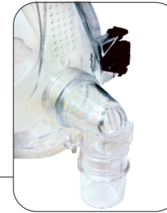
A built-in safety valve automatically opens during non-invasive ventilation if more flow is needed.