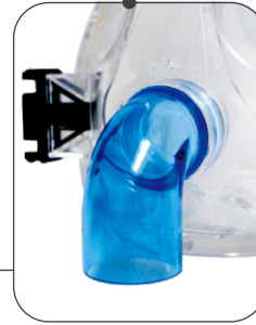
A non-vented blue elbow option is available for non-leak ventilation.