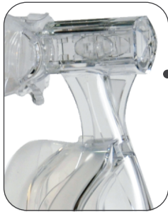
Adjustable forehead support system; helps to minimize leaks and adds to your comfort.

Advanced Cushion Design allows active control of the seal. The specialized vent ports disperse airflow efficiently and quietly. Advanced comfort and fit mean greater user compliance.