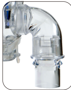
Advanced specialized exhaust port design means a quiet experience for you.