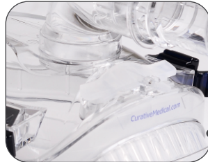
Endoscope access port allows endoscopy procedure in conjunction with ventilation.