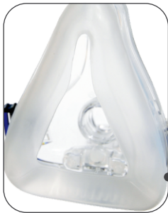
Personalized cushion design means a personal seal for each person. The mask feels so comfortable you think it was made just for you.